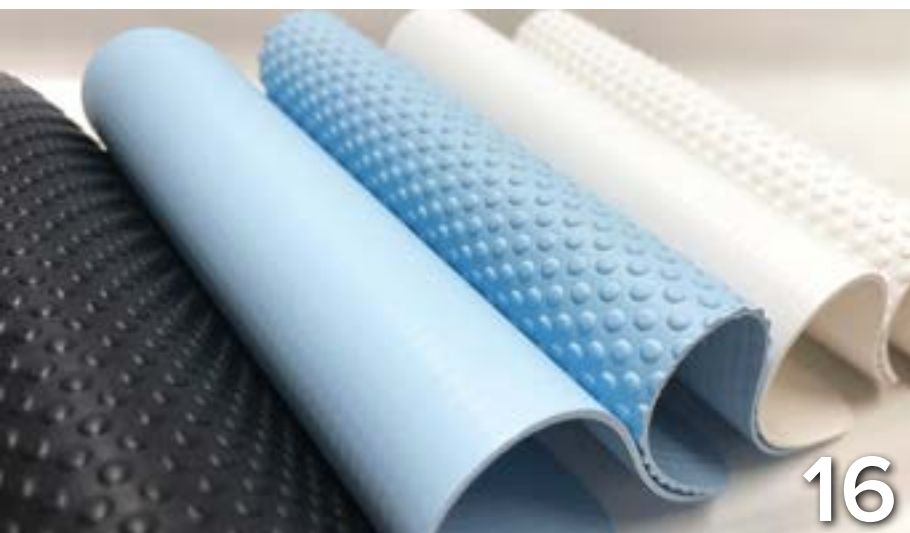
ON THE COVER PAGE: